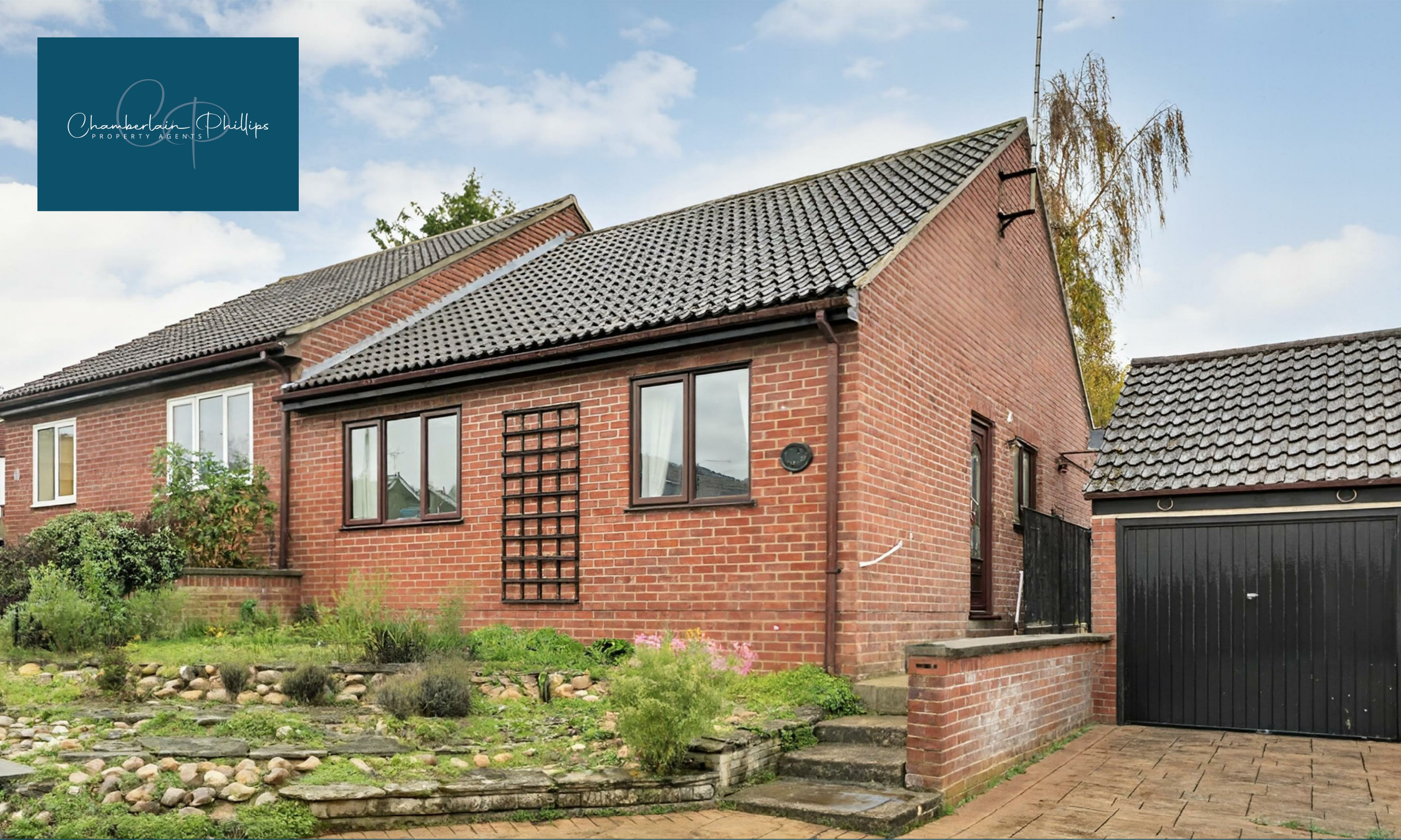
Cedar Close, Brantham £270,000