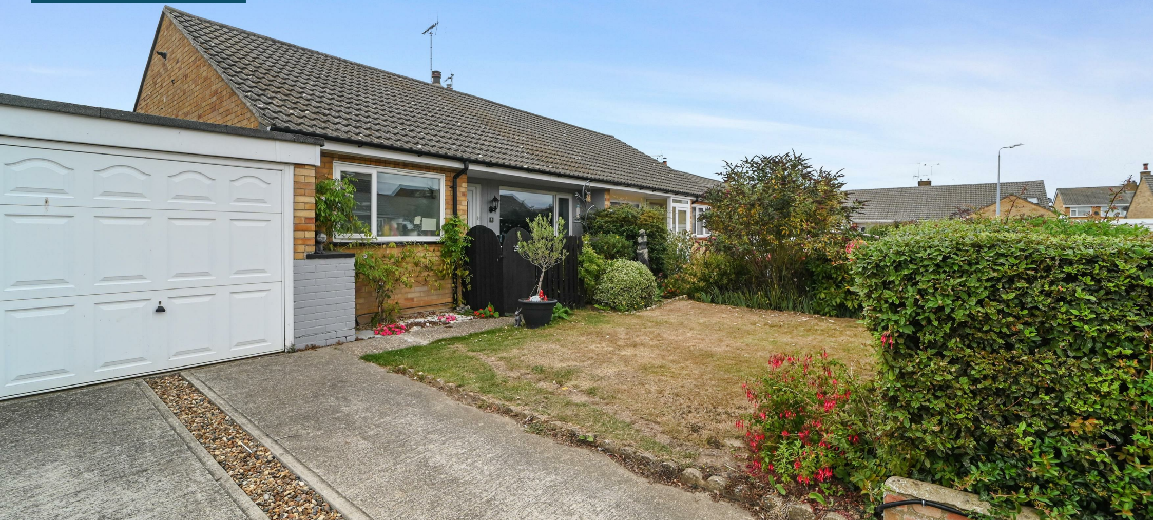
Linden Close, Manningtree £325,000