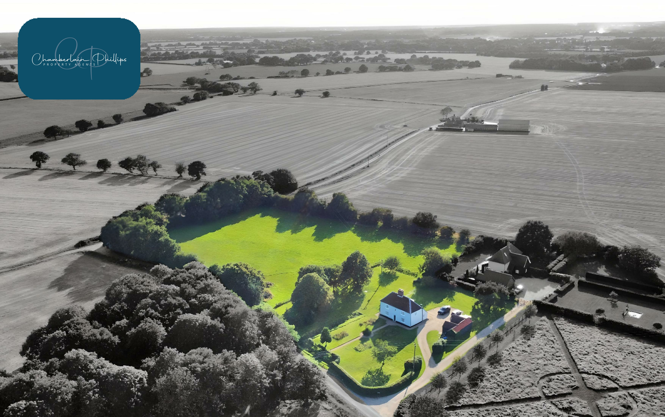
Little Bromley Guide Price £900,000