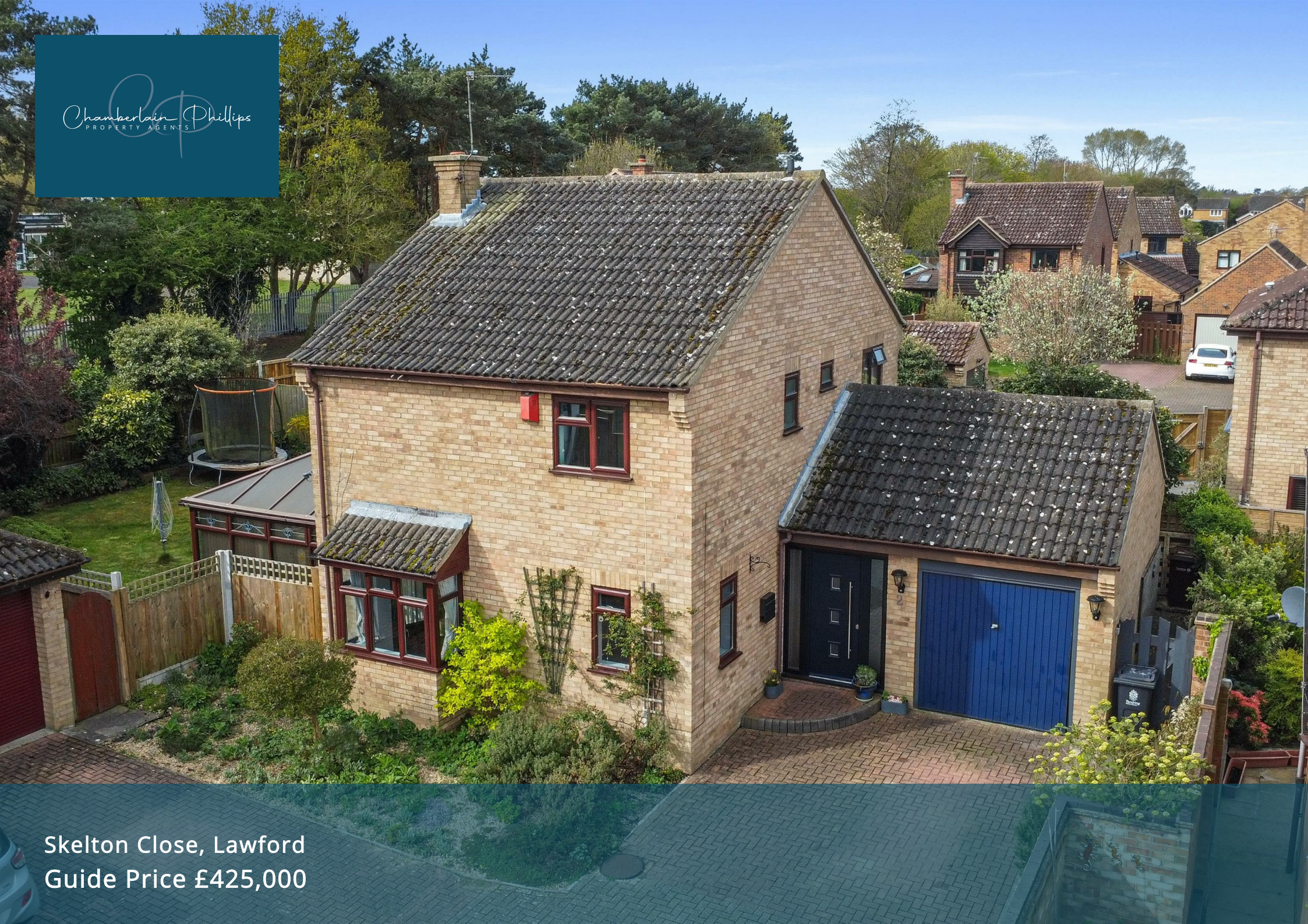
Skelton Close, Lawford Guide Price £425,000