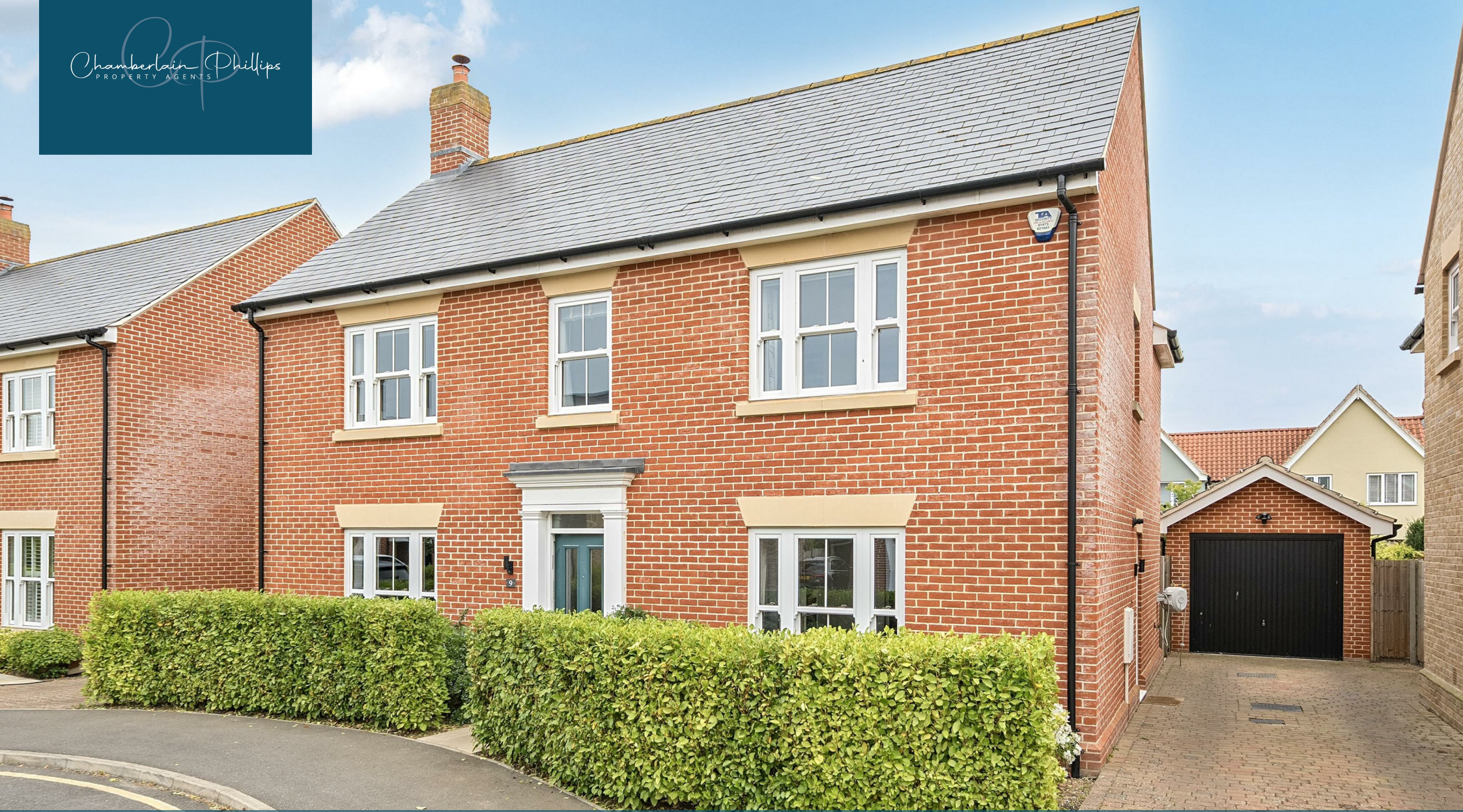
Florence Gardens, Lawford £650,000