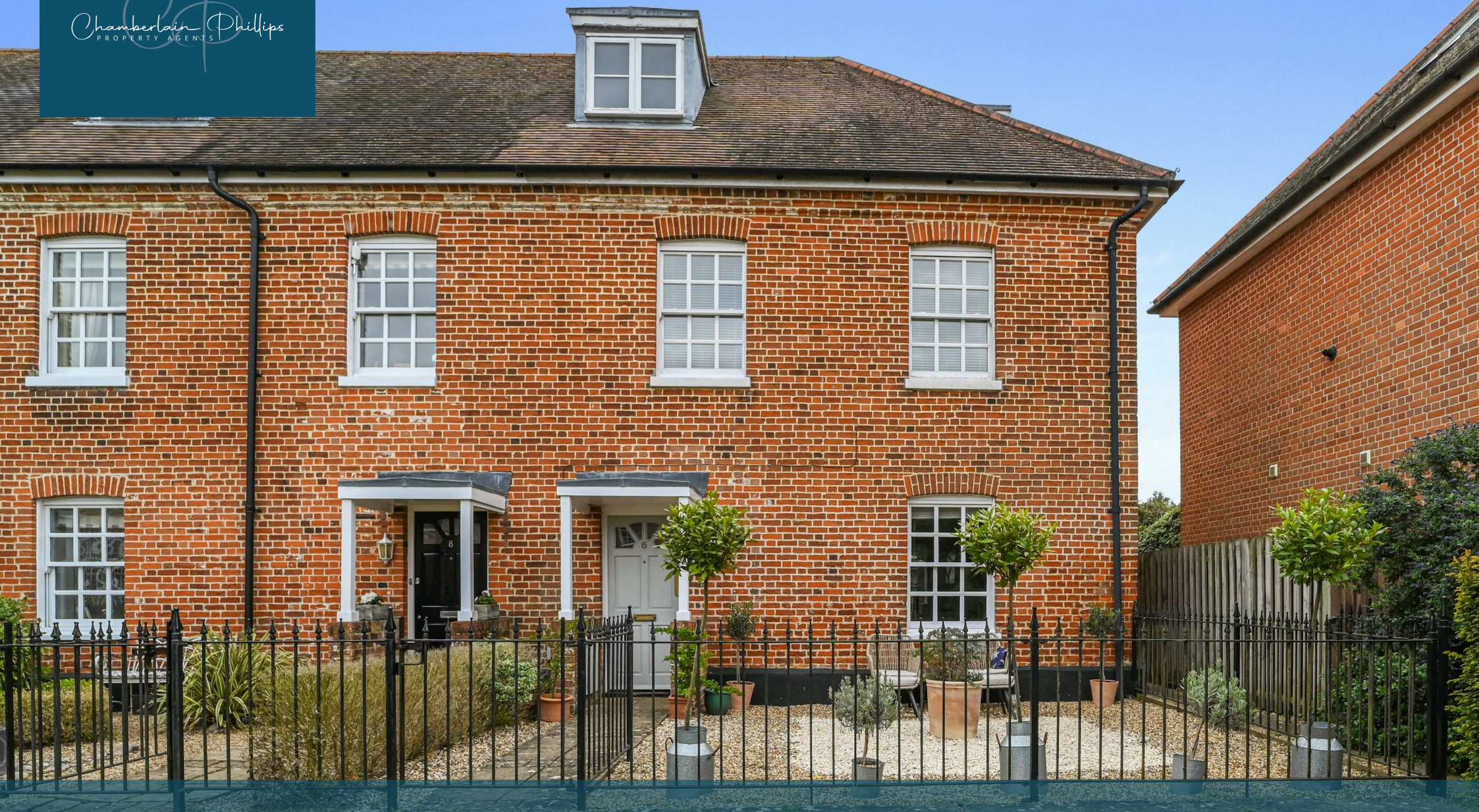
Chedworth Place, Tattingstone £350,000