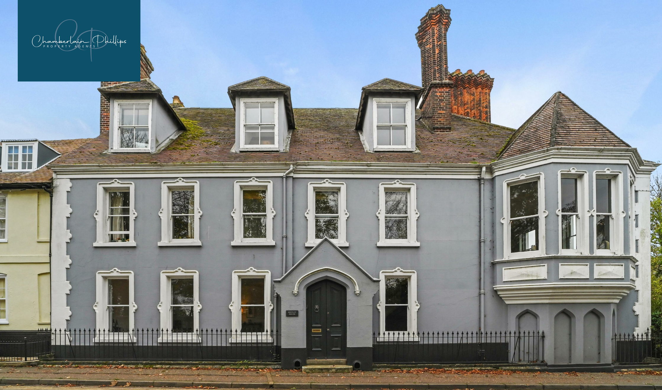
Mistley House, High Street £1,295,000