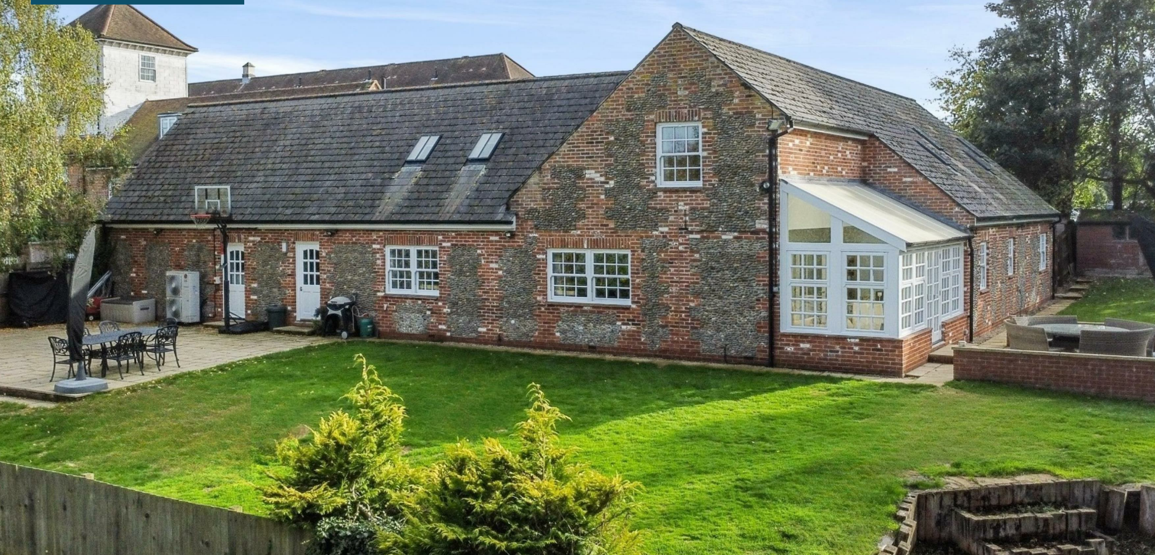
Tattingstone Guide Price £1,000,000