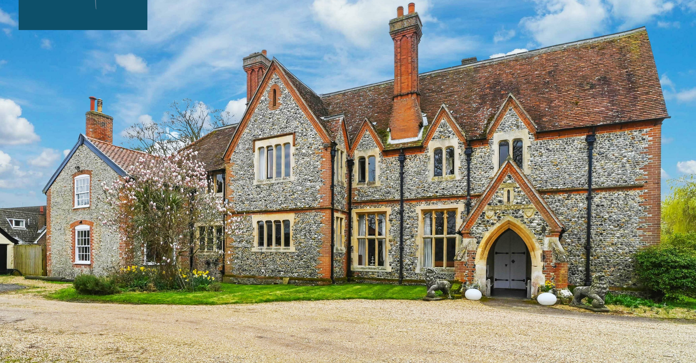
Creting St. Mary £1,750,000