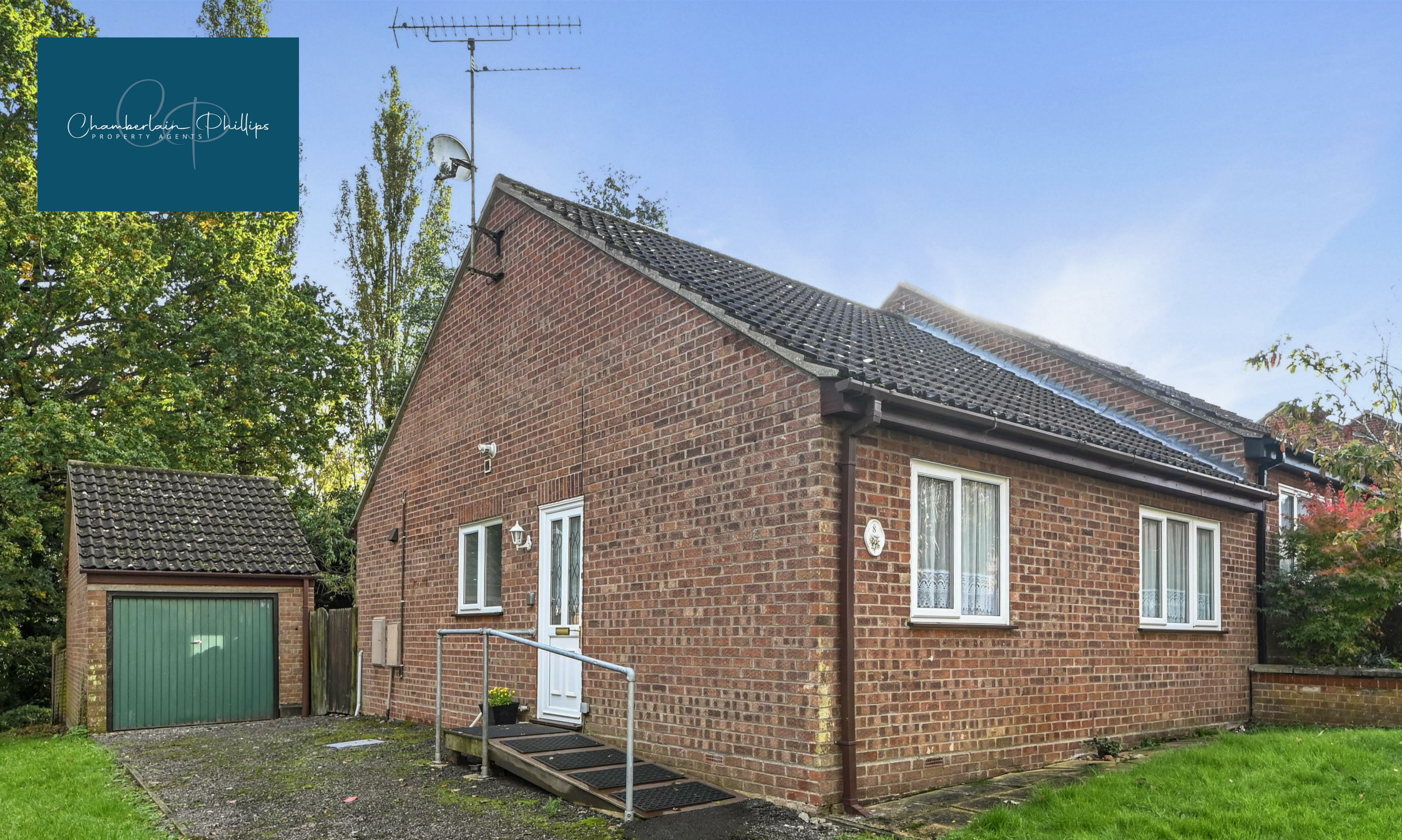
Cedar Close, Brantham £270,000