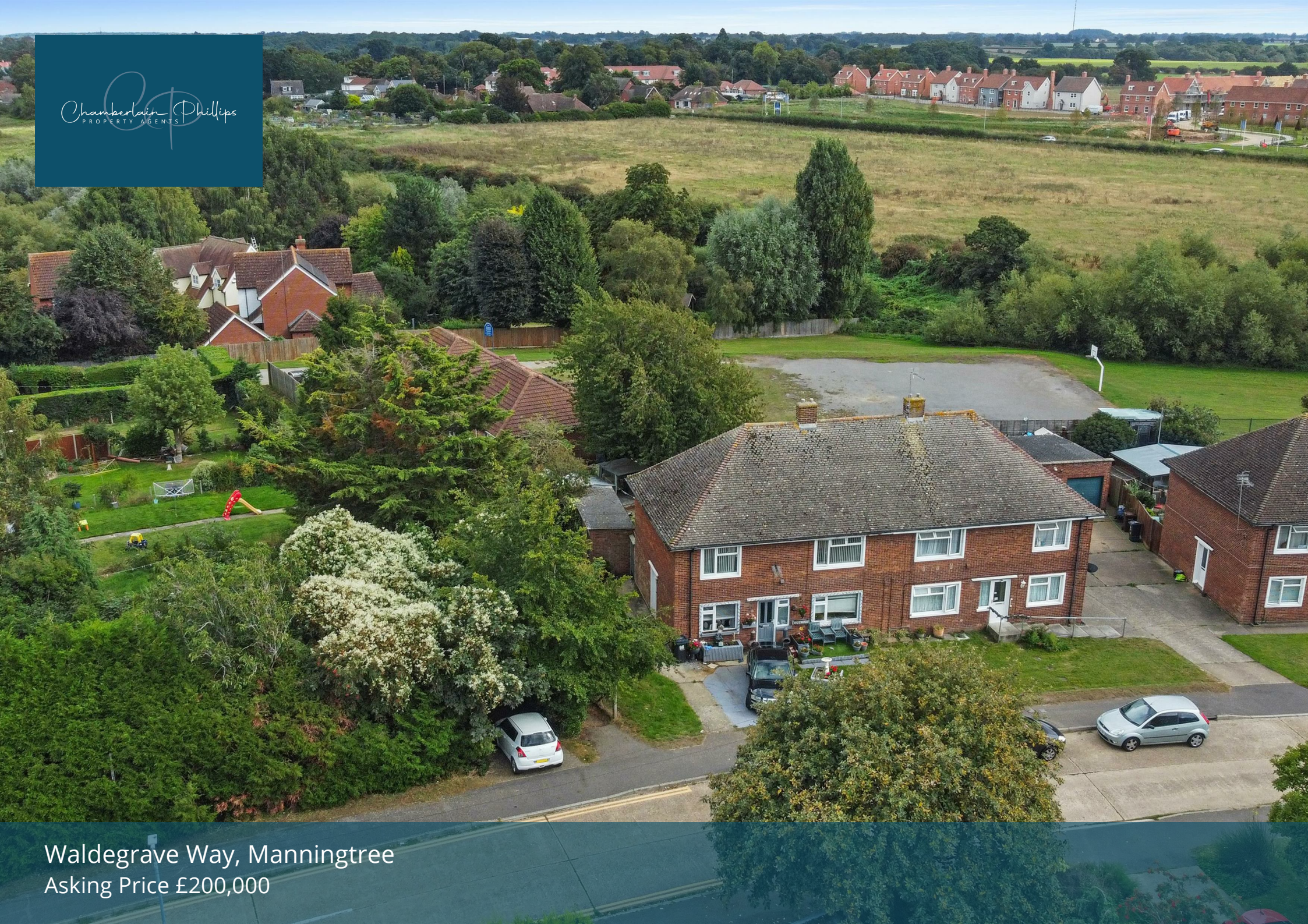
Waldegrave Way, Manningtree Asking Price £200,000