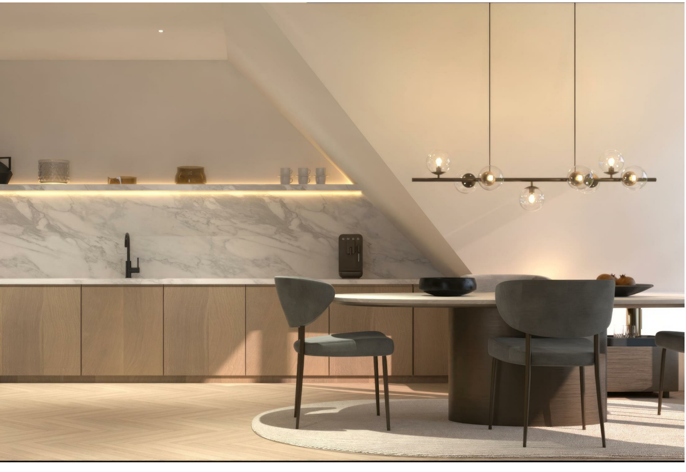
Escape the hustle and bustle of Central London and discover an exclusive oasis in the heart of Ealing, West London with Oh So Close.

Nestled just steps away from the picturesque Walpole Park and serene Lammas Park, this prestigious development offers the perfect combination of tranquillity and convenience.