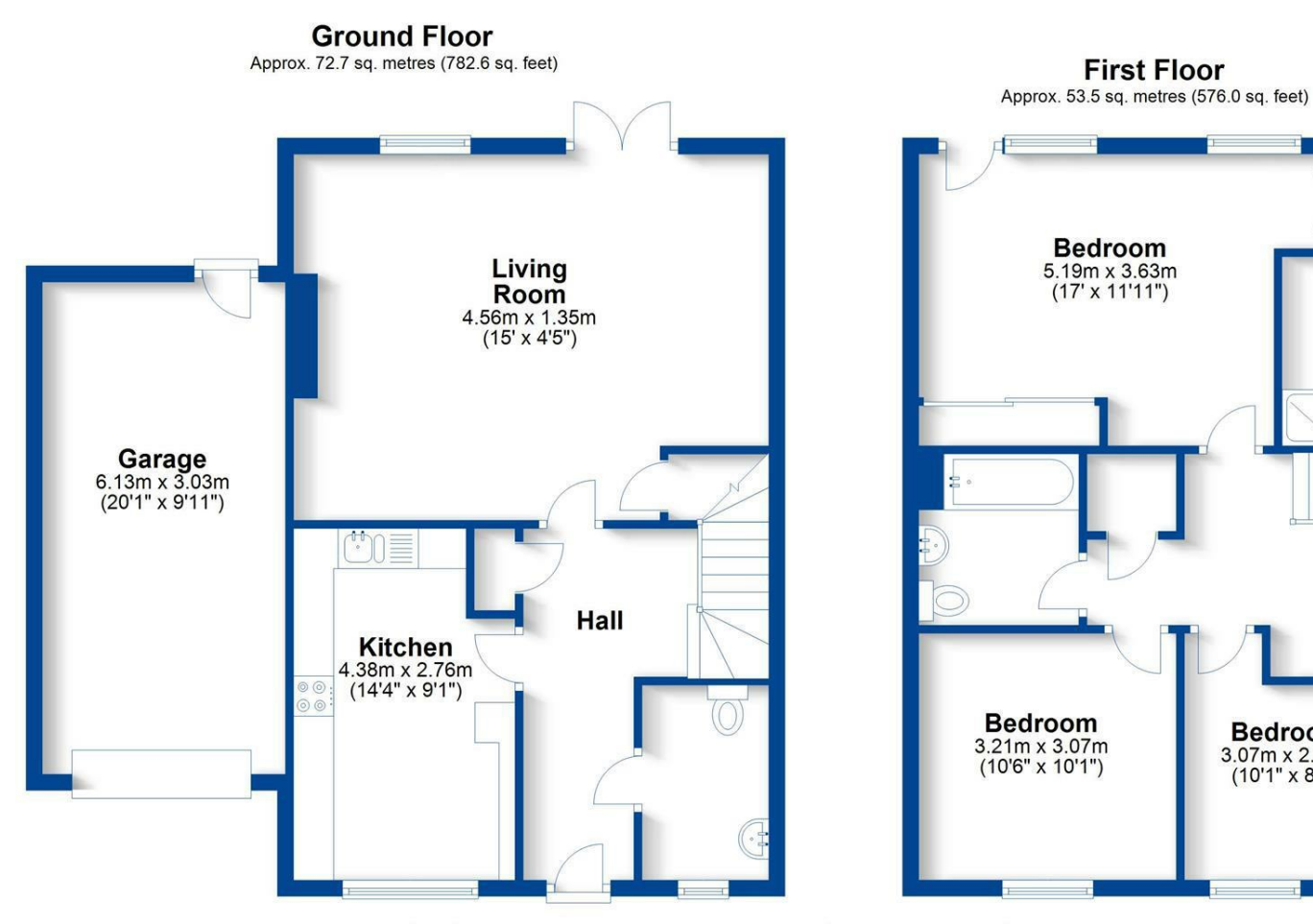
Total area: approx. 126.2 sq. metres (1358.6 sq. feet) This plan is for illustration purposes only and should not be relied upon as a statement of fact