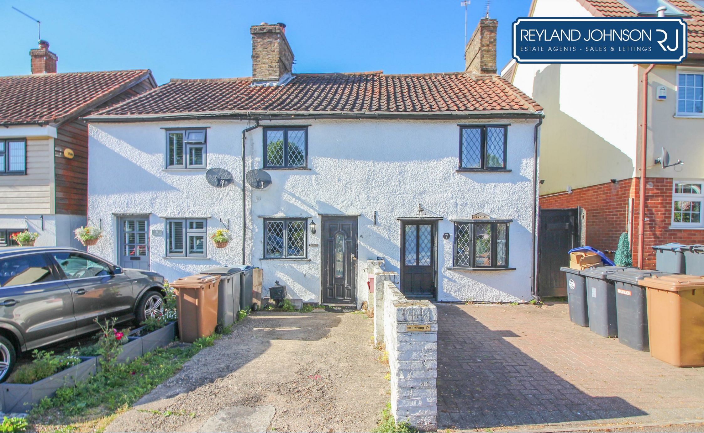
Half Moon Cottages, Sawbridgeworth, CM21 0HY £400,000