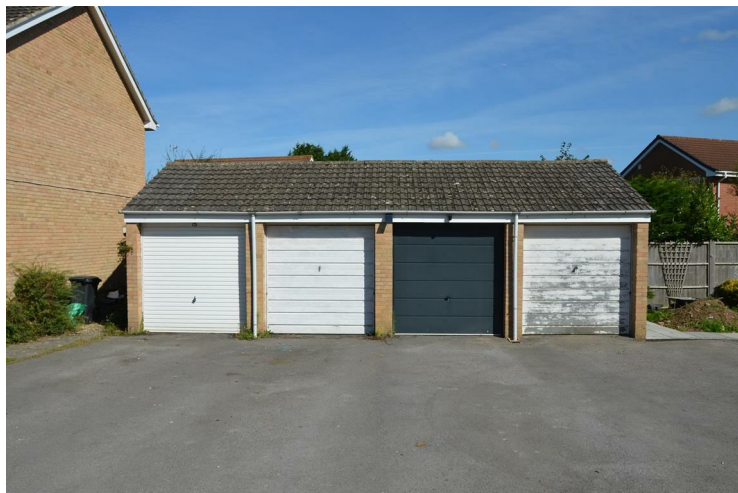
Accessed via an up and over door. Driveway in front of the garage for 2 cars.

APPROX GROSS INTERNAL FLOOR AREA: 740 sq. ft / 69 sq. m