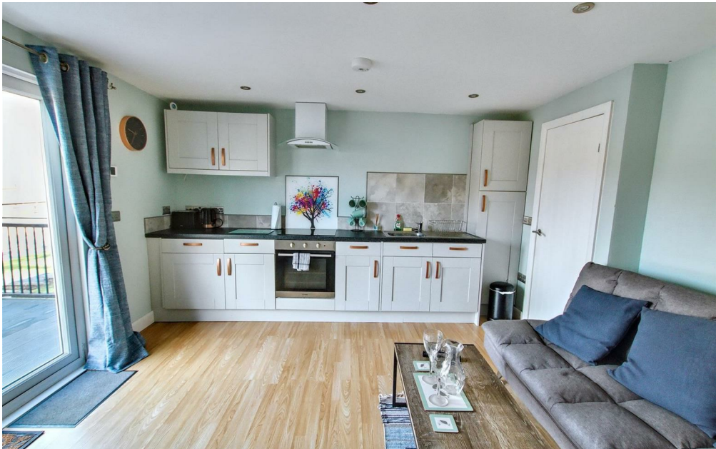
Open Plan Living