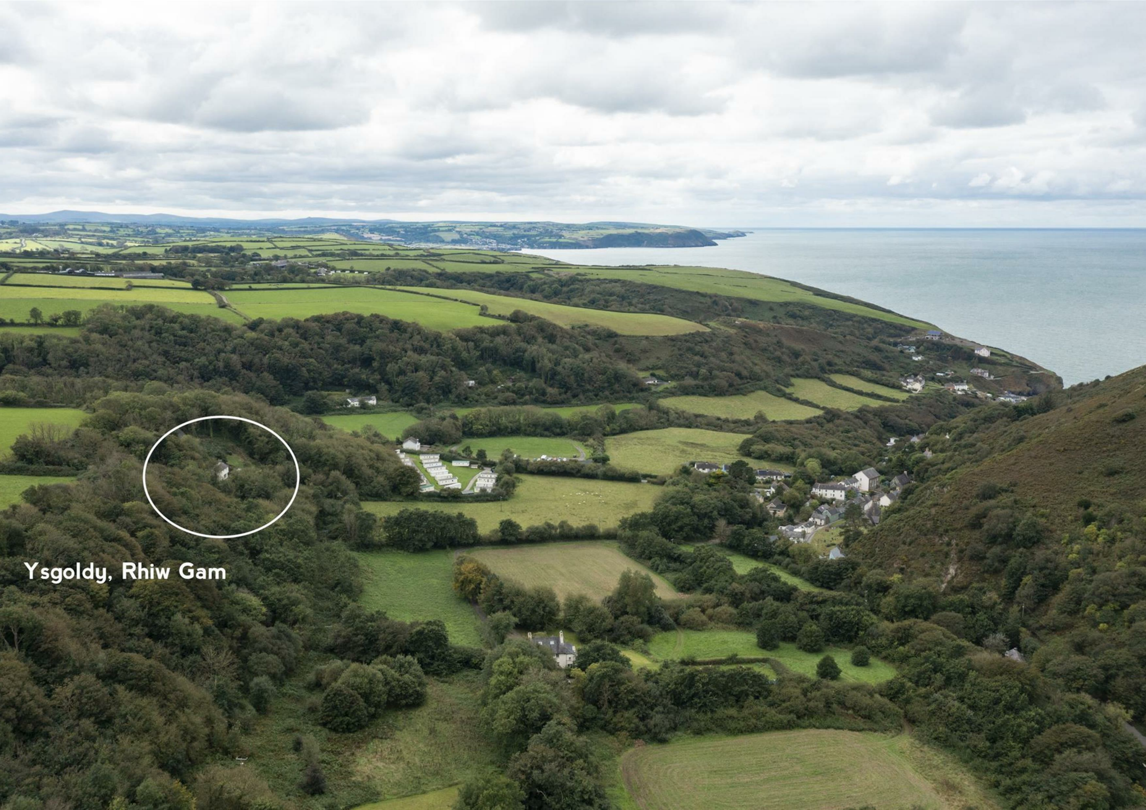
Ysgoldy, Rhiw Gam