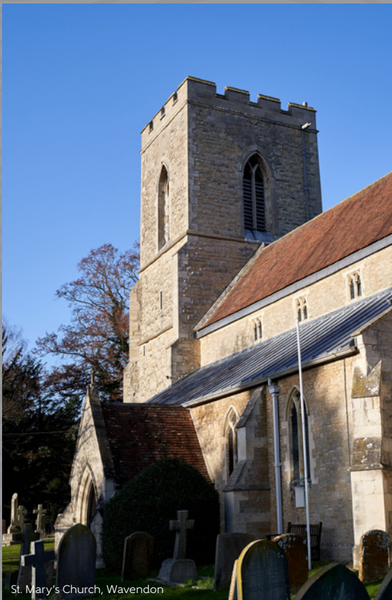
St. Mary's Church, Wavendon

Commuters at Wavendon View are well catered for by both road and rail. The nearby A421 provides a direct link to junction 13 of the M1, which can be reached in under 10 minutes by car. Travelling eastwards, the A421 provides a route into Milton Keynes, located less than 5 miles from Wavendon View. Milton Keynes Central station is just over five miles from the development with regular services to major destinations such as Edinburgh, London Euston, Crewe, Birmingham New Street and Chester. International travel is provided by Luton Airport, around 30 minutes away by car.