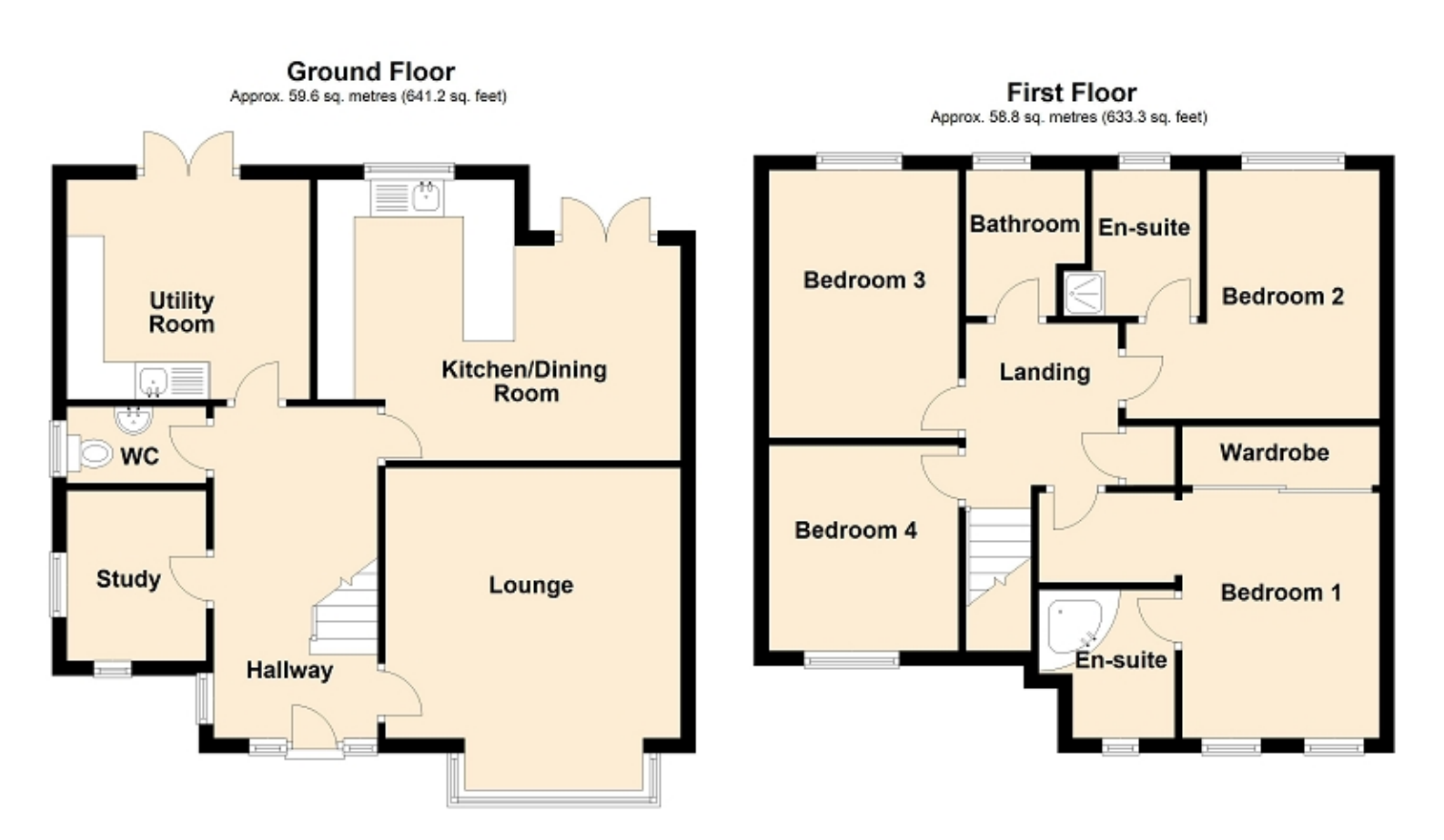
Total area: approx. 118.4 sq. metres (1274.5 sq. feet)