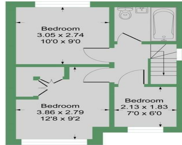
First Floor Approximate Floor Area 341.38 sq.ft (31.71 sq.m)