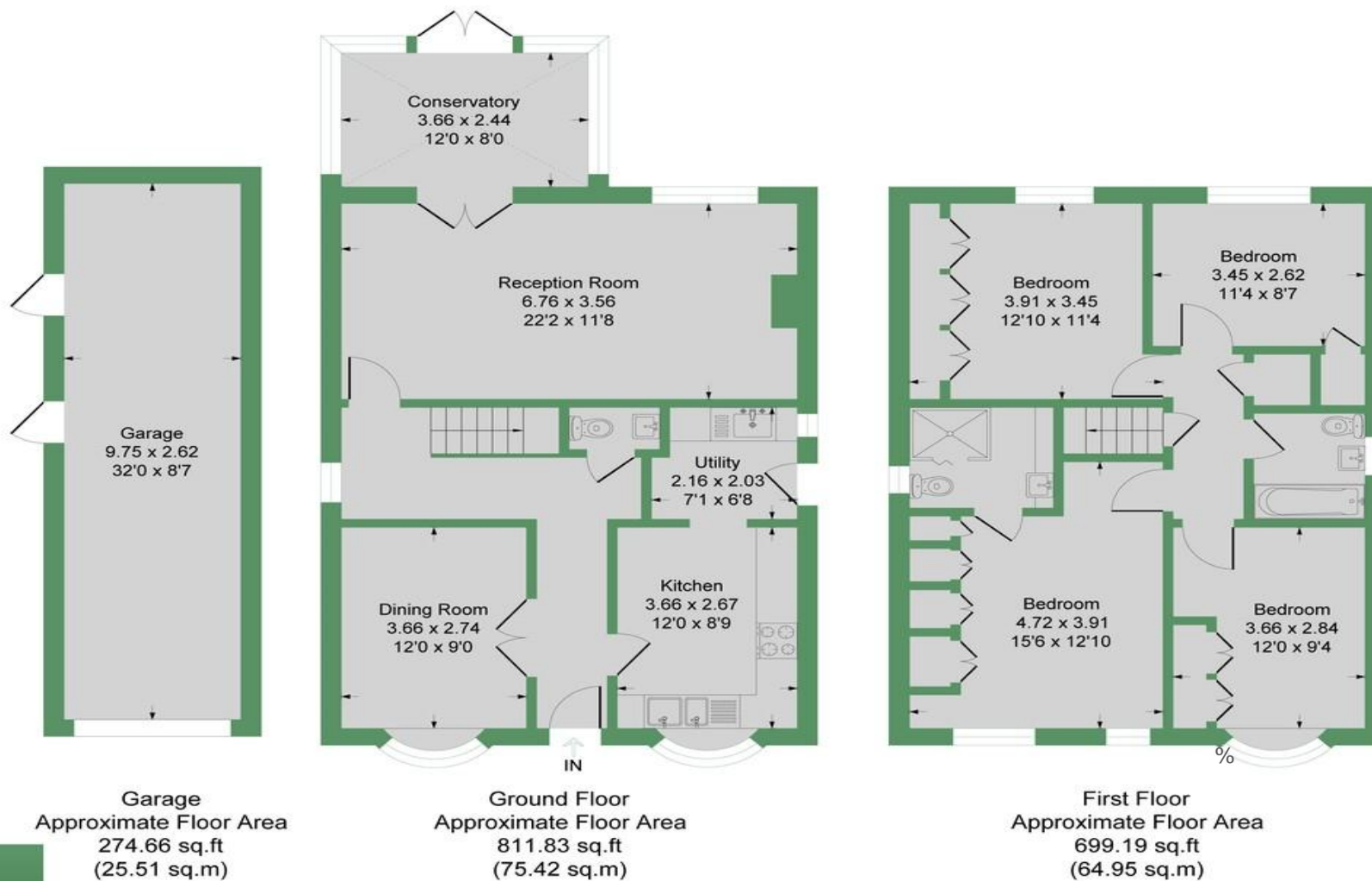
Illustration for identification purposes only, measurements are approximate, not to scale. Produced By Esjay Property Marketing

Approximate Gross Internal Floor Area = 165.8 sq m / 1786 sq ft