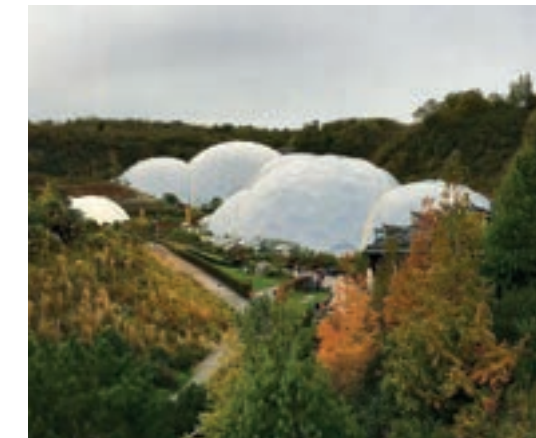
01 EDEN PROJECT, BOLDELVA