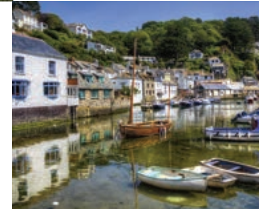
03 POLPERRO, CORNWALL