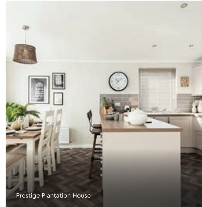
Prestige Plantation House