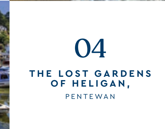
04 THE LOST GARDENS OF HELIGAN, PENTEWAN