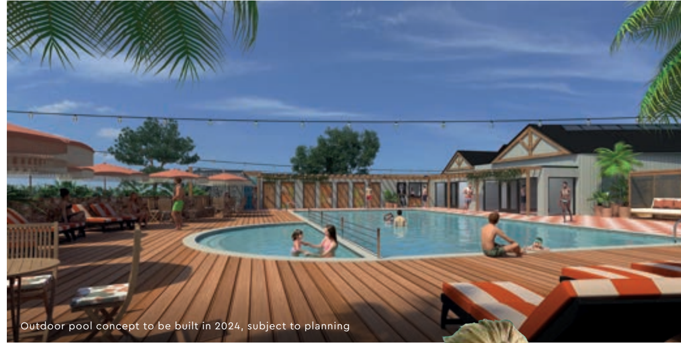
Outdoor pool concept to be built in 2024, subject to planning