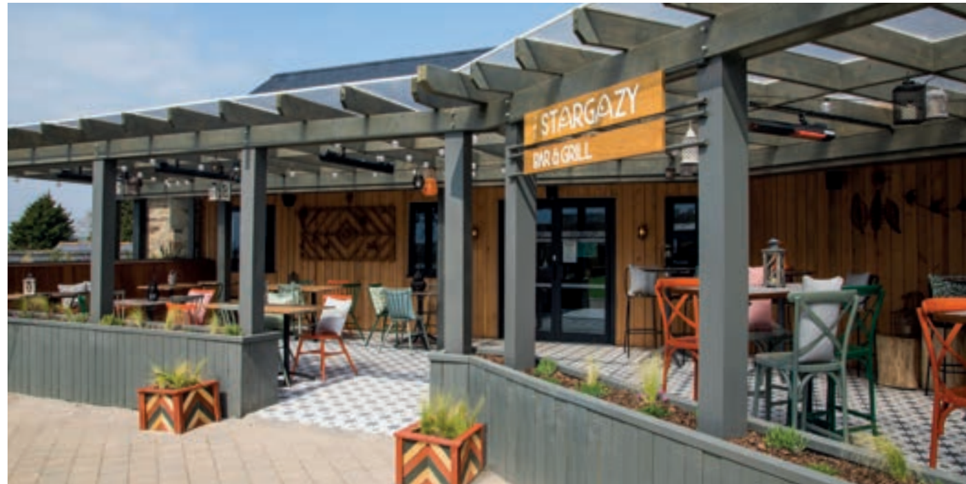
WINE & DINE

We also encourage you to explore some of the foodie hotspots on our doorstep. You'll find fresh fish, shellfish and signature Cornish cream teas in nearby Looe, Polperro and Fowey. It's a gastronomic paradise.