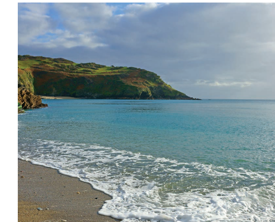
02 LANTIC BAY, FOWEY