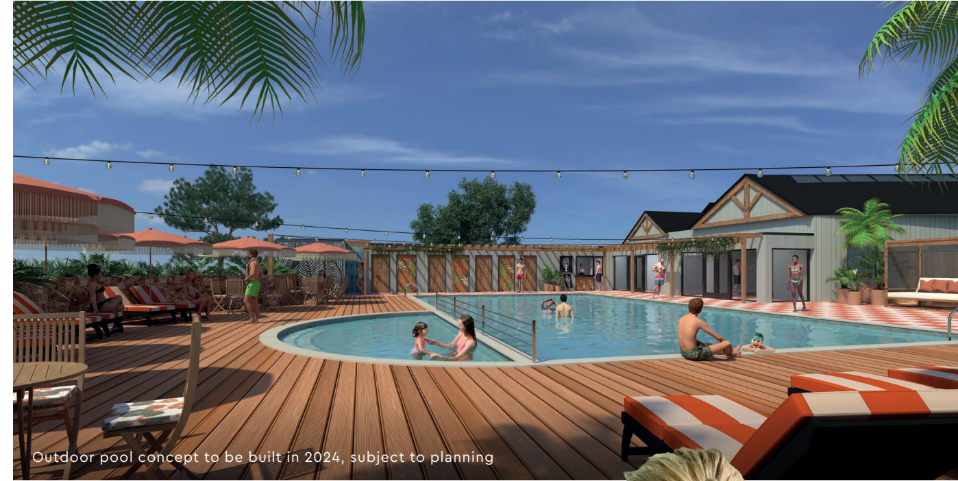
Outdoor pool concept to be built in 2024, subject to planning