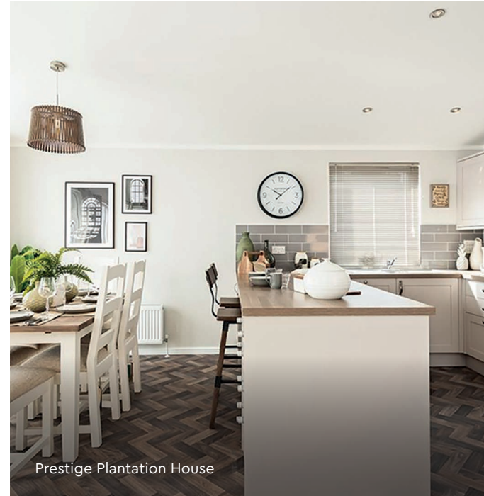
Prestige Plantation House