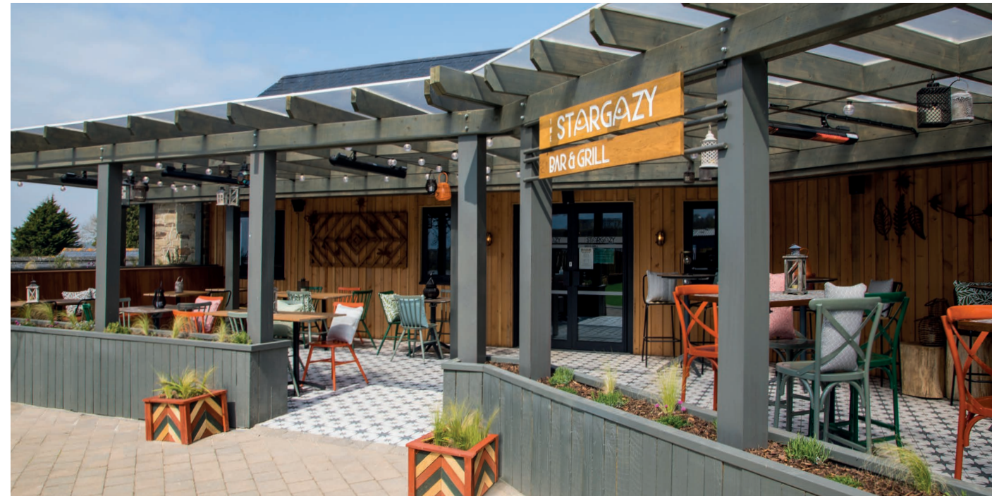
WINE & DINE

We also encourage you to explore some of the foodie hotspots on our doorstep. You'll find fresh fish, shellfish and signature Cornish cream teas in nearby Looe, Polperro and Fowey. It's a gastronomic paradise.