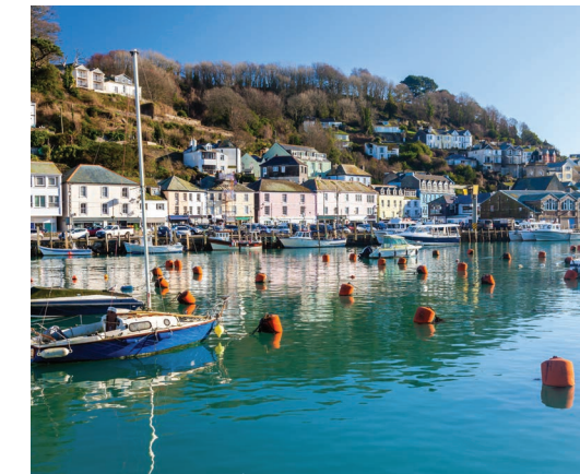
05 LOOE, CORNWALL