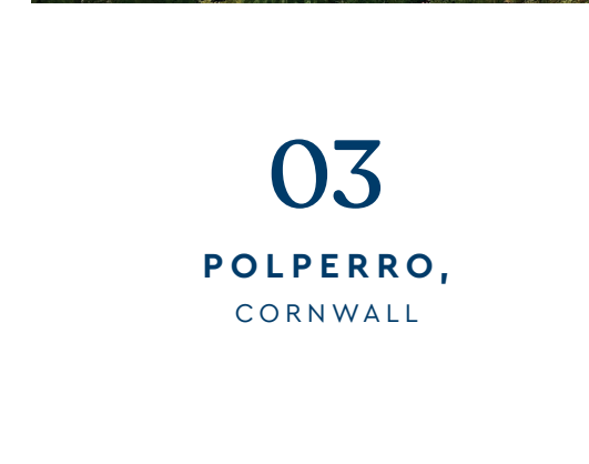
03 POLPERRO, CORNWALL