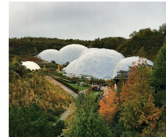
01 EDEN PROJECT, BOLDELVA