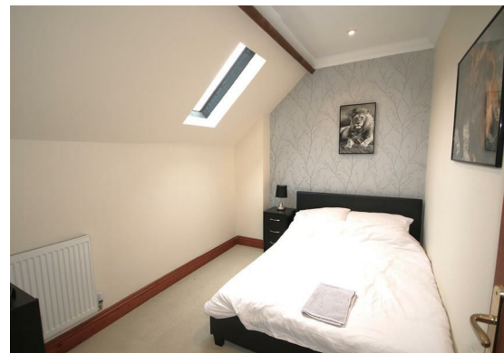
Bedroom 1 9'7" x 17'11" (2.936 x 5.477)