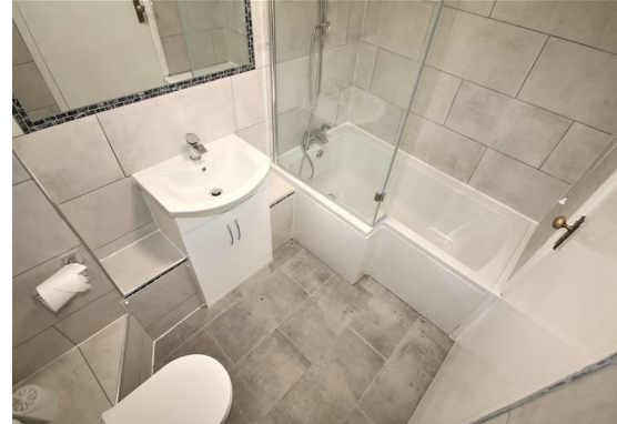
Bedroom 8'3" x 12'10" (2.524 x 3.930) Bathroom 5'1" x 7'10" (1.569 x 2.395) Living Room 14'10" x 11'8" (4.523 x 3.576) Kitchen 9'3" x 5'1" (2.823 x 1.569)