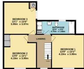
1ST FLOOR 896 sq.ft. (82.8 sq.m.) approx.