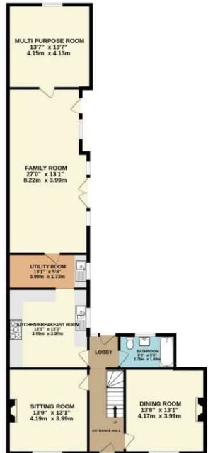
GROUND FLOOR 1283 sq.ft. (119.0 sq.m.) approx.