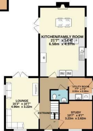
TOTAL FLOOR AREA: 2303 sq.ft. (213.9 sq.m.) approx.

Whilst every attempt has been made to ensure the accuracy of the floorplan contained here, measurements of doors, windows, rooms and any other items are approximate and no responsibility is taken for any error, omission or mis-statement. This plan is for illustrative purposes only and should be used as such by any prospective purchaser. The services, systems and appliances shown have not been tested and no guarantee as to their operability or efficiency can be given. Made with: Metropix ©2023