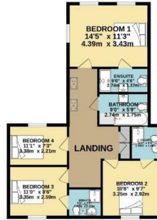
1ST FLOOR 753 sq.ft. (70.0 sq.m.) approx.

Whilst every attempt has been made to ensure the accuracy of the floorplan contained here, measurements of doors, windows, rooms and any other items are approximate and no responsibility is taken for any error, omission or mis-statement. This plan is for illustrative purposes only and should be used as such by any prospective purchaser. The services, systems and appliances shown have not been tested and no guarantee as to their operability or efficiency can be given. Made with: Metropix ©2023