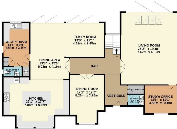
GROUND FLOOR 2019 sq.ft. (187.5 sq.m.) approx.