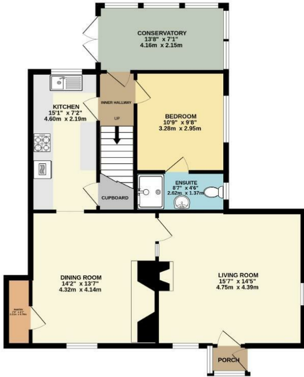
GROUND FLOOR 828 sq.ft. (76.9 sq.m.) approx.