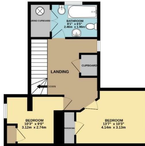
1ST FLOOR 456 sq.ft. (42.4 sq.m.) approx.