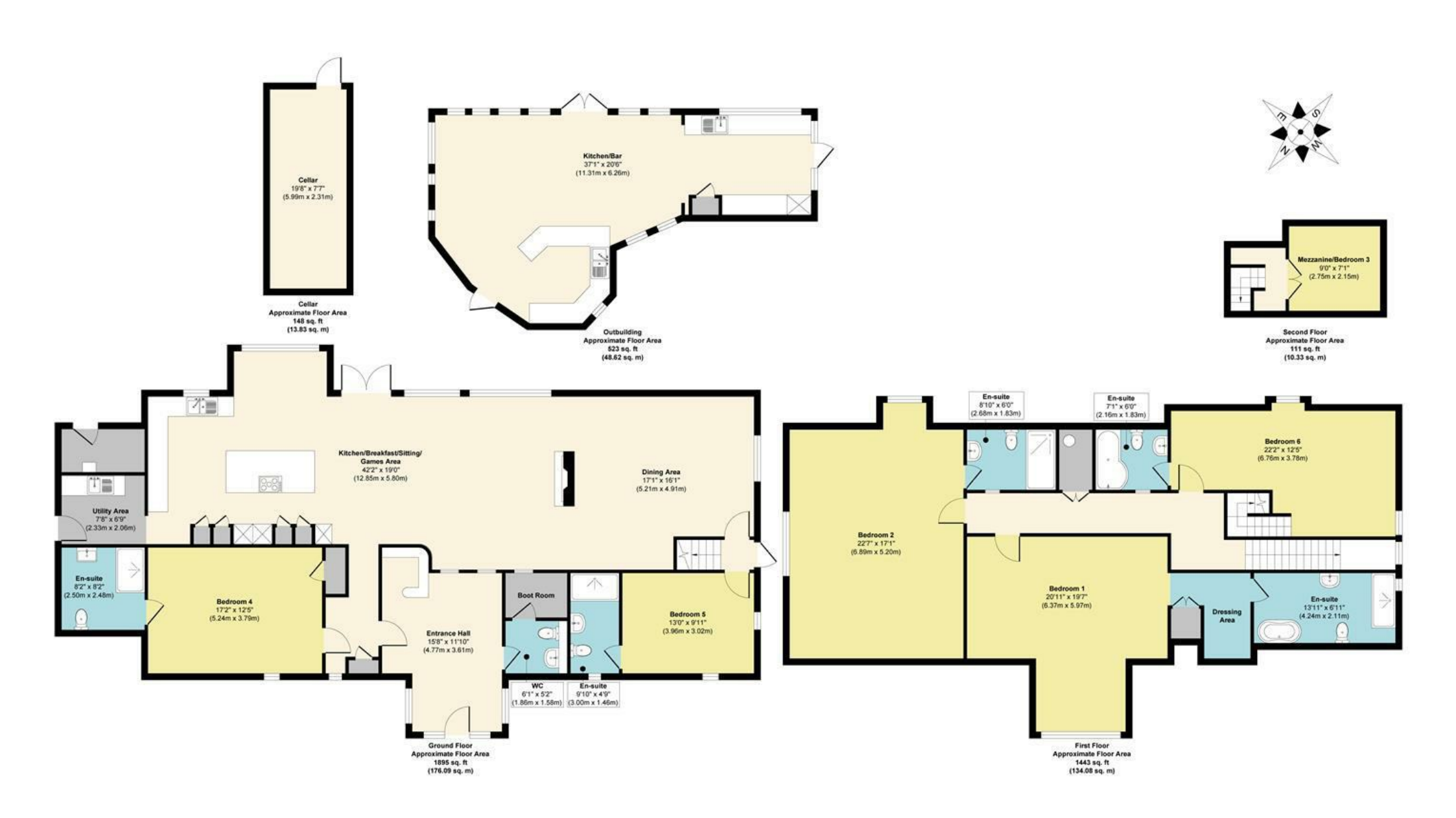
Approx. Gross Internal Floor Area 4120 sq. ft / 382.95 sq. m (Including Outbuilding )

Illustration for identification purposes only, measurements are approximate, not to scale. Produced by Elements Property