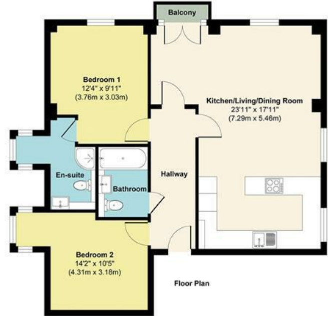
Approx. Gross Internal Floor Area 786 sq. ft / 73.05 sq. m Illustration for identification purposes only, measurements are approximate, not to scale. Produced by Elements Property