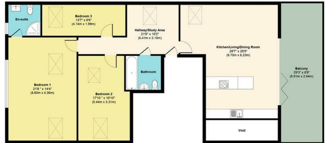
Approx. Gross Internal Floor Area 1302 sq. ft / 120.97 sq. m Illustration for identification purposes only, measurements are approximate, not to scale. Produced by Elements Property