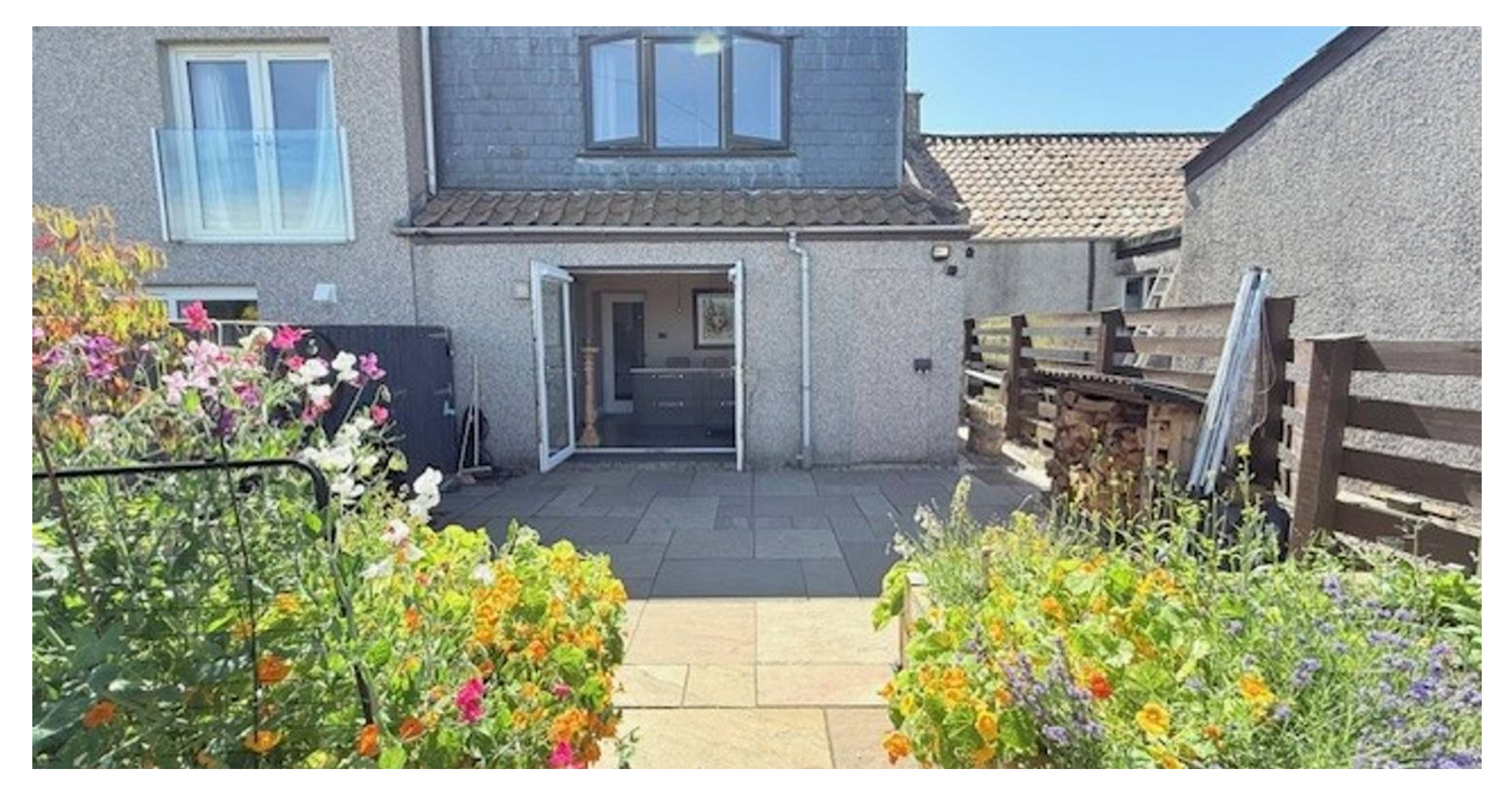
Linallan Knowehead, Freuchie – KY15 7HB Cupar