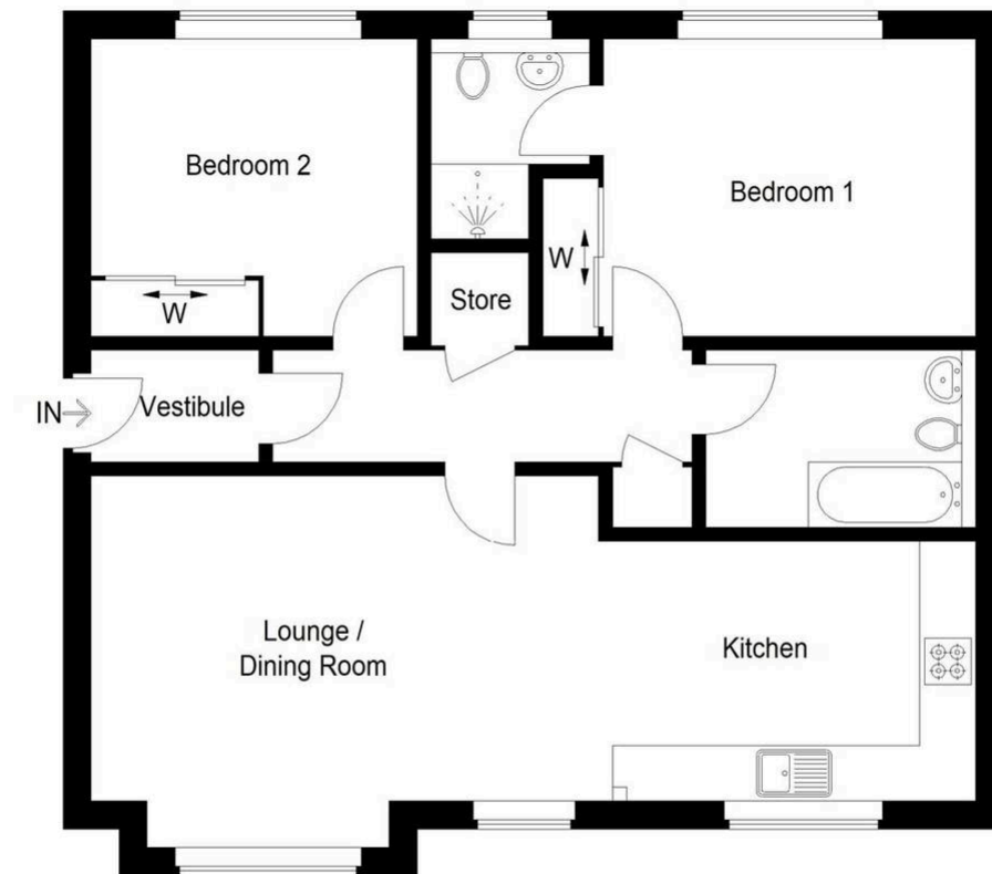
Illustration for identification purposes only, measurements are approximate, not to scale. FloorplansUsketch.com © 2025 (ID1196631)

You can include any text here. The text can be modified upon generating your brochure.