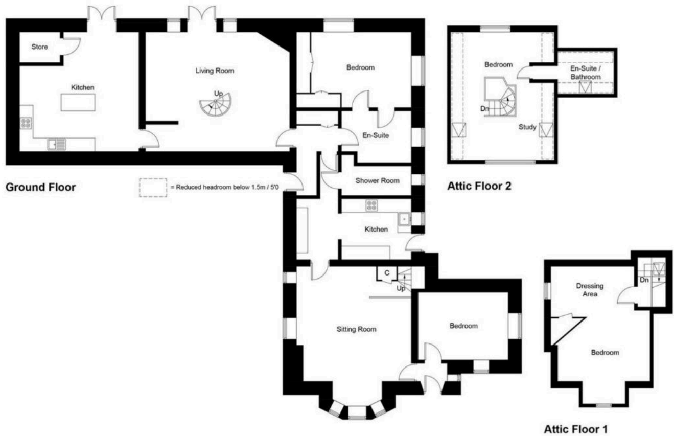
Illustration for identification purposes only, measurements are approximate, not to scale. Fourlabs.co © (ID1206317)

You can include any text here. The text can be modified upon generating your brochure.