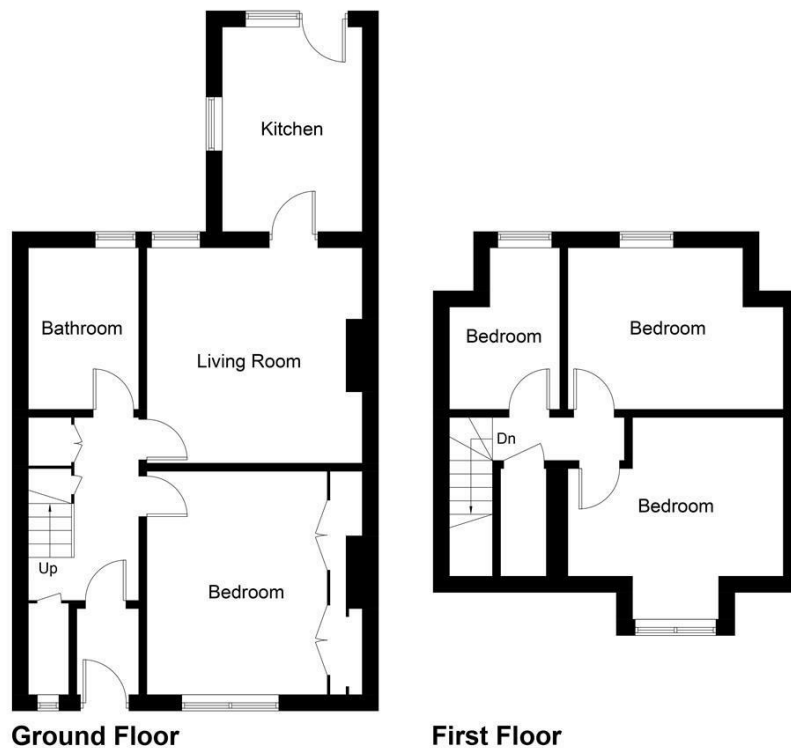
Illustration for identification purposes only, measurements are approximate, not to scale. Fourlabs.co © (ID1175694)