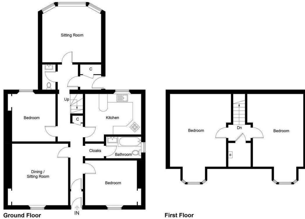
Illustration for identification purposes only, measurements are approximate, not to scale. floorplansUsketch.com © (ID1126263)