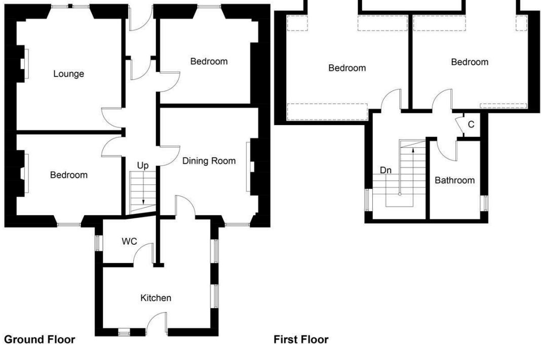
Illustration for identification purposes only, measurements are approximate, not to scale. floorplansUsketch.com © (ID1097805)