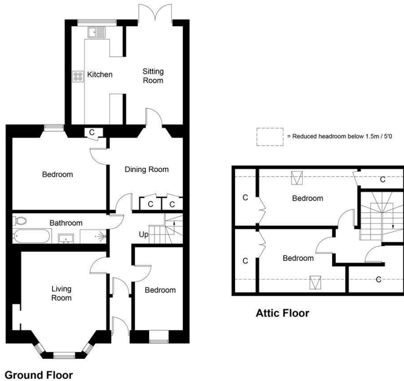
Illustration for identification purposes only, measurements are approximate, not to scale. floorplansUsketch.com © (ID1079182)