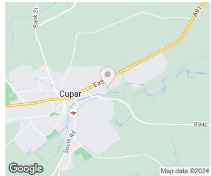
Illustration for identification purposes only, not to scale.