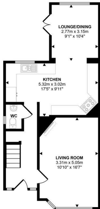
Ground Floor Approx 50 sq m / 536 sq ft

Approx Gross Internal Area 103 sq m / 1107 sq ft