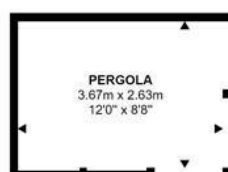
Pergola Approx 10 sq m / 104 sq ft

This floorplan is only for illustrative purposes and is not to scale. Measurements of rooms, doors, windows, and any items are approximate and no responsibility is taken for any error, omission or mis-statement. Icons of items such as bathroom suites are representations only and may not look like the real items. Made with Made Snappy 360.