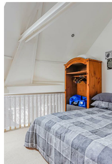
Ymca Lofts, Woodlands Road, Barry, CF62 8EB