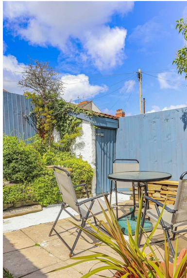
Fairford Street, Barry, CF63 1BY