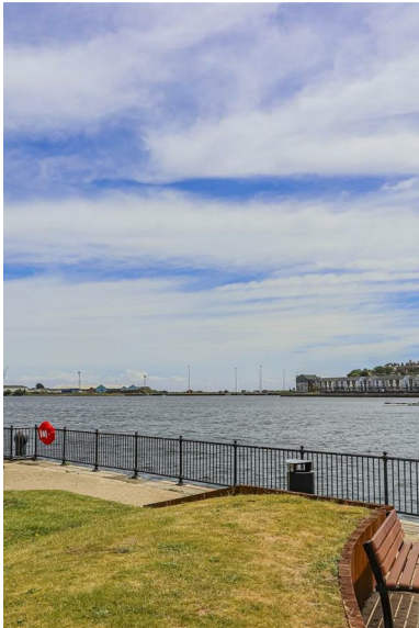
Cei Tir Y Castell, Barry, CF63 4DG