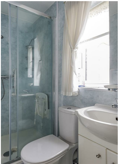
Parc Clwyd, Barry, CF63 1DS