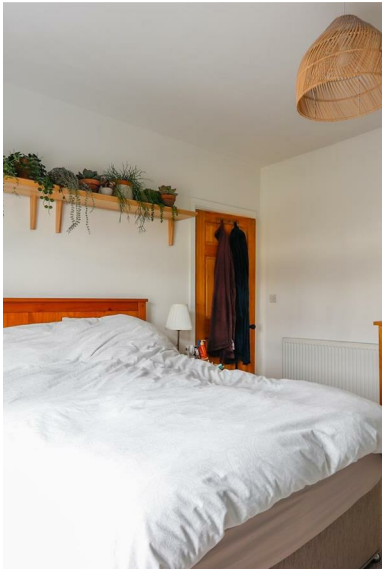
Wenvoe Terrace, Barry, CF62 7ES