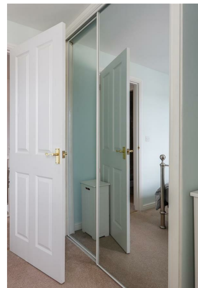
Ffordd Y Mileniwm, Barry