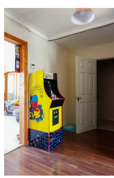
St Brannocks Close, Barry, CF62 7NH