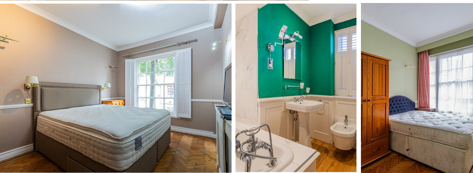
Westgate Street, City Center, CRF Ground Floor Apartment Interior Area 799.48 sq ft