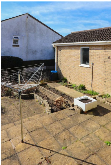
Taf Close, Barry, CF62 7QU